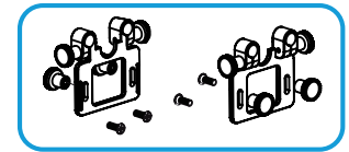
Rod Accessory kit