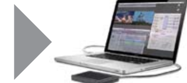
Connect this media to either your Apple MacBook Pro or Apple Mac Pro. Import the footage into Final Cut Pro. Edit. Simple.