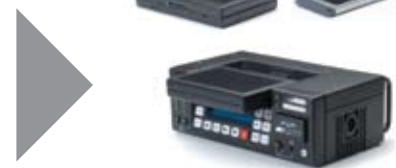
Remove the Storage Module or ExpressCard 34 media from Ki Pro.